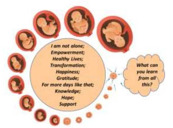
Figure 3 – Learning of pregnant women in the experience of the Virtual Culture Circle